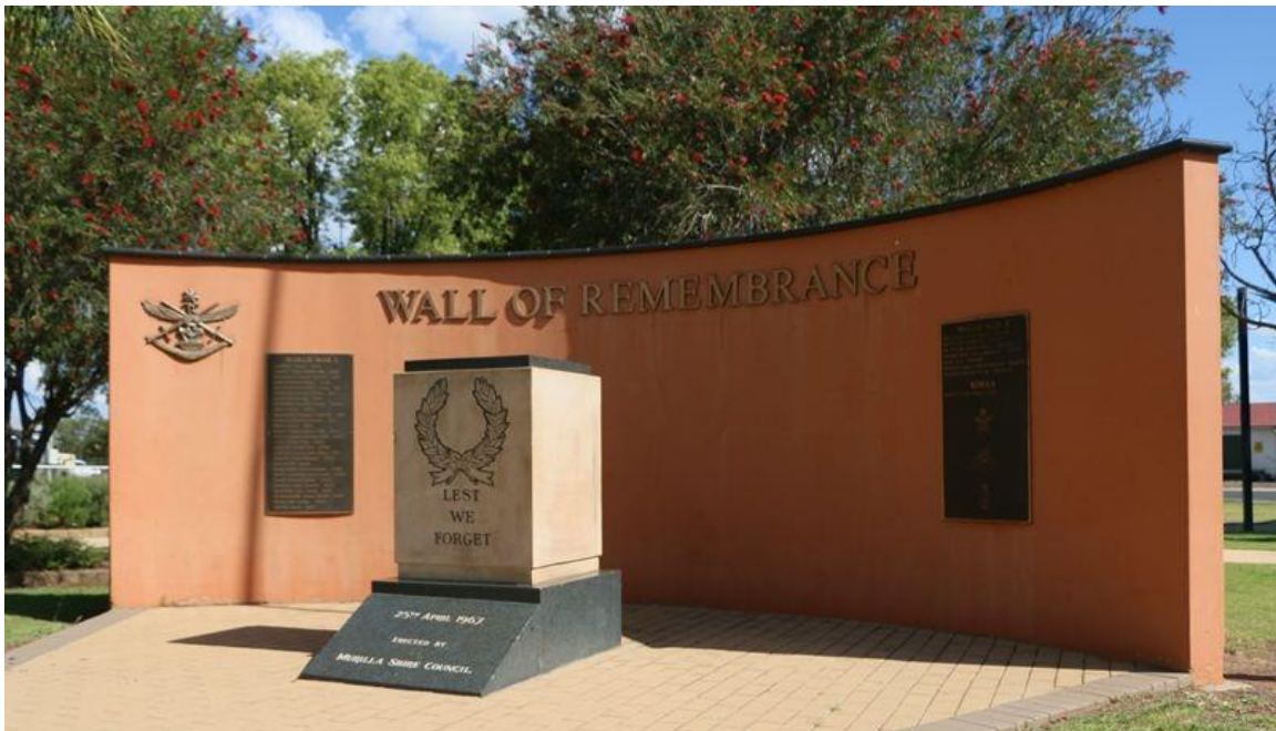
Wall of Remembrance, Miles